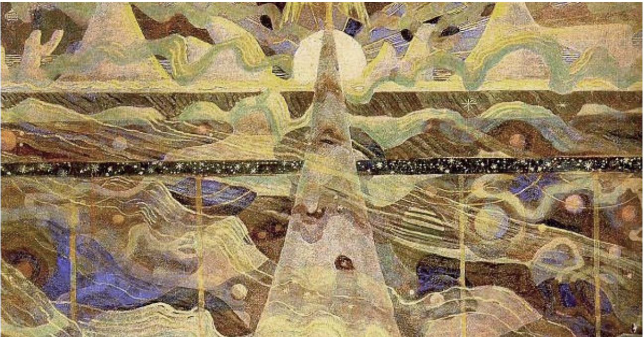
M.K. Ciurlionis – Sonata of the Stars

Newmoon: Saturday 17th March, at 2.30pm CET